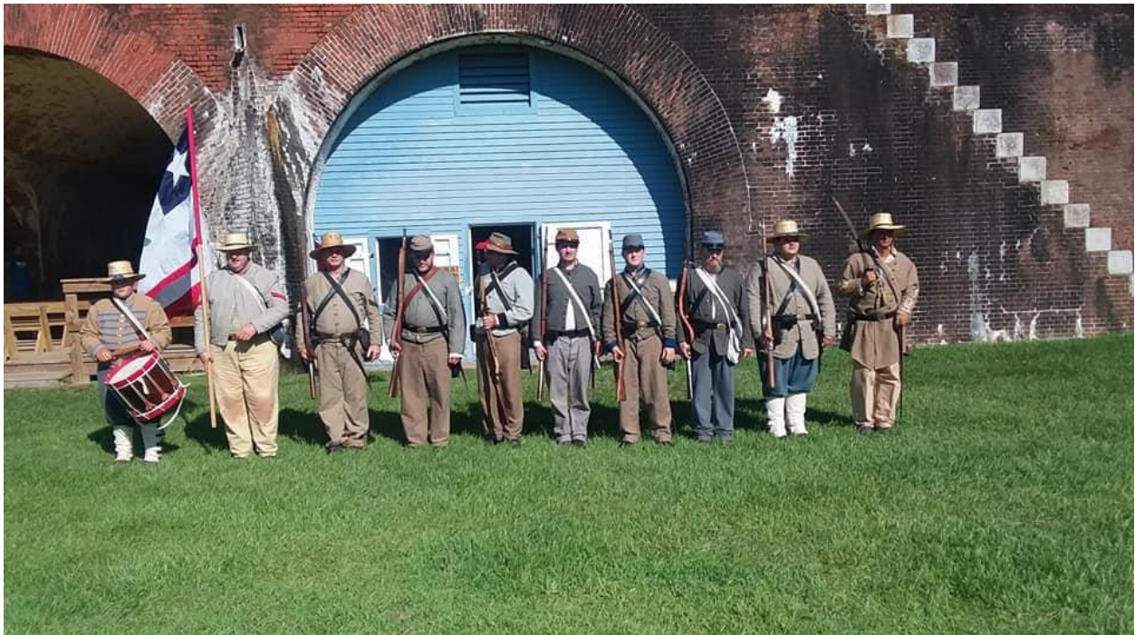
The Shieldsboro Rifles at Fort Morgan in August 2019.

Photos are of the Shieldsboro Rifles during Garrison Duty defending each fort. Top pic was Fort Morgan, bottom pic was Fort Gaines.