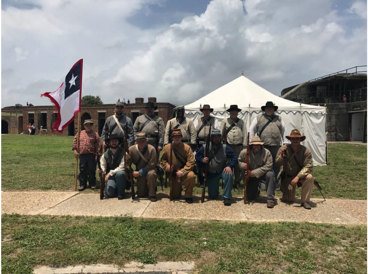
The Shieldsboro Rifles at Fort Gaines in May 2018.